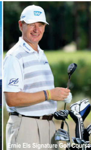
Ernie Els Signature Golf Course