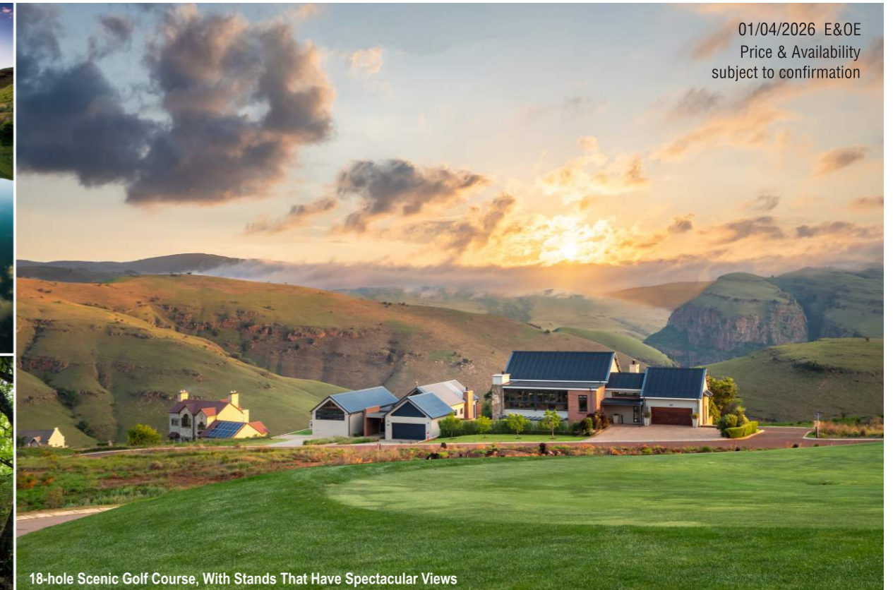
18-hole Scenic Golf Course, With Stands That Have Spectacular Views

01/04/2026 E&OE Price & Availability subject to confirmation