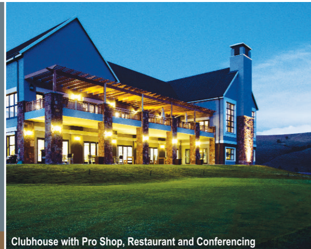
Clubhouse with Pro Shop, Restaurant and Conferencing